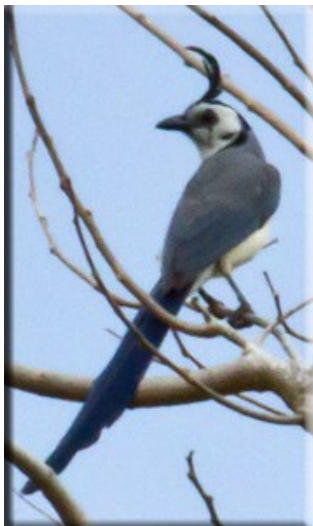
White-throated Magpie-Jay

Welcome to Comala, Pueblo Magico! Comala, known for its botanas, pan dulce, ponche', white buildings with red tile roofs, stunning view of Volcan de Colima, and wonderful ambience is one of Mexico's Pueblos Magicos - small cities noteworthy for their charm and character. The people are friendly, the pace leisurely, and the birding magnificent. In fact, the State of Colima and a small adjacent portion of the State of Jalisco is, along with the State of Oaxaca, one of Mexico's two most famous birding areas, attracting birders from around the world.